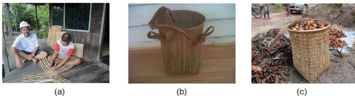
Figure 3. Tengkalang (a) Making Process (b) Tengkalang (c) Tengkalang used