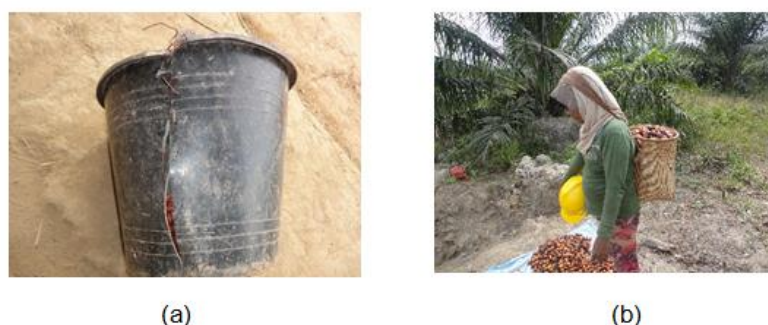
Figure 4. the use of (a) buckets (b) employees use the fulcrum of the fulcrum on the head